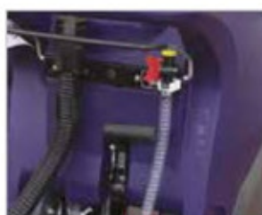
Solution tank level gauge and drain hose