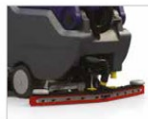
Yellow touchpoints for easy daily maintenance