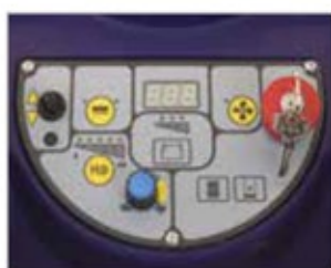
Intuitive control panel with electronic water flow control